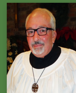
~ Benno ~

In every church I have attended, the ushers eventually take the collection plates to the front of the church; give them to someone else, who then gives them to the minister or priest. The priest says a few words and then hides the offerings under or behind the altar.