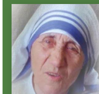
~ Mother Teresa ~

Sacrifice is easy when we "think about what Jesus will gain and not what little me will lose..."